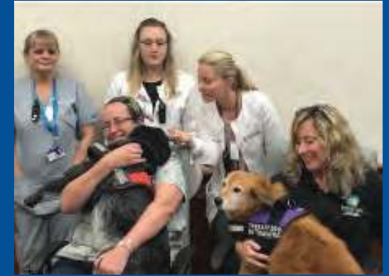
"Love On A Leash" Pet Therapy at Robert ,Packer Hospital

Our "Love On A Leash" program trains community residents and their dogs to become therapy animals who are ready to greet residents in nursing homes and hospitals.