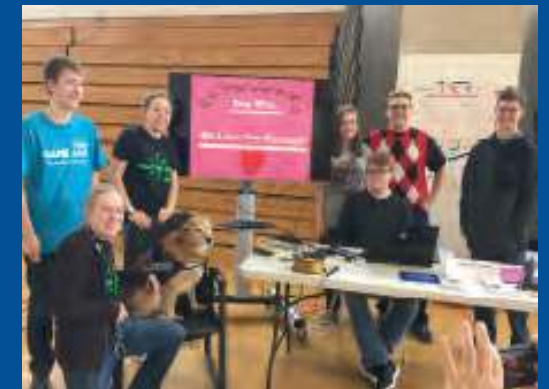
Career Day at Troy High School

Humane education serves as a strategy for large-scale change in the quality of animal's lives through prevention and intervention programs designed to create a culture of empathy and compassion. We offer programs from pre-school through college.